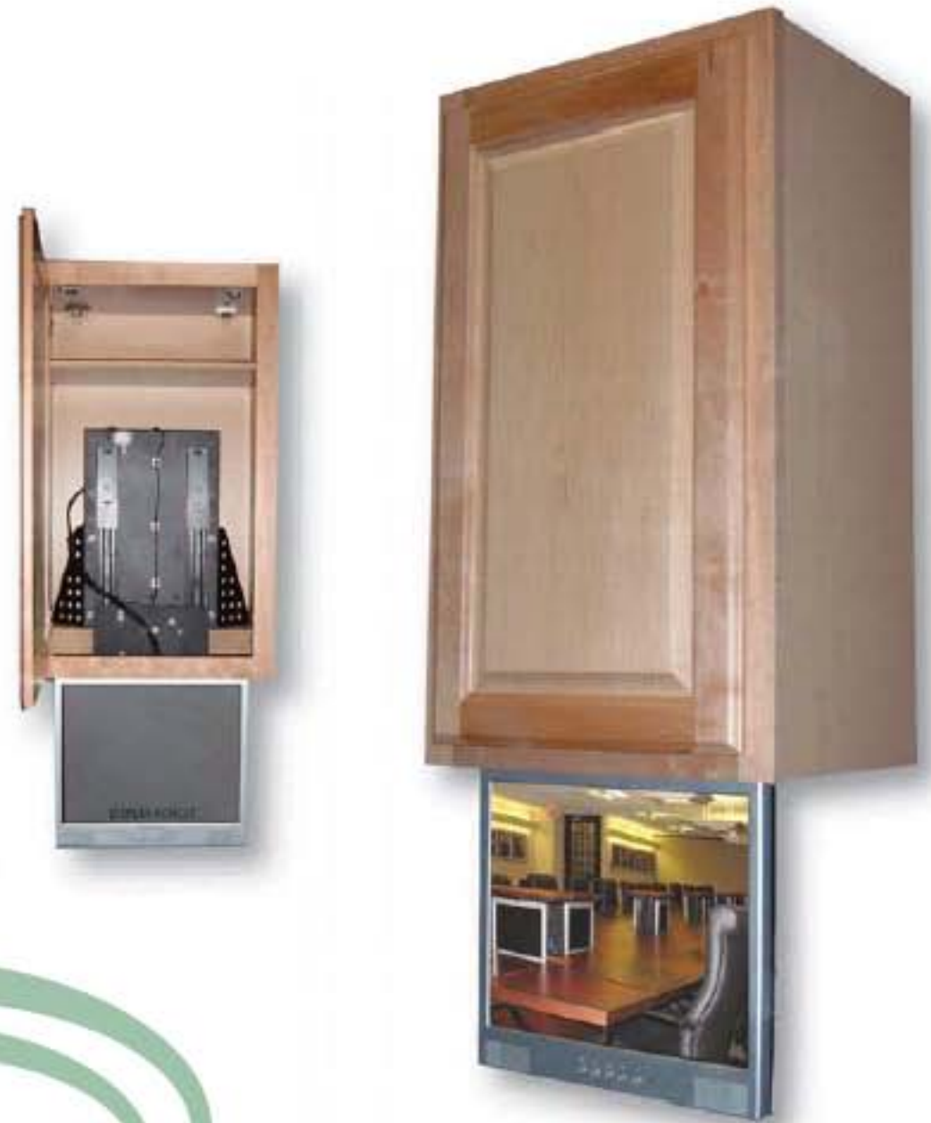
Shown with monitor and cabinet